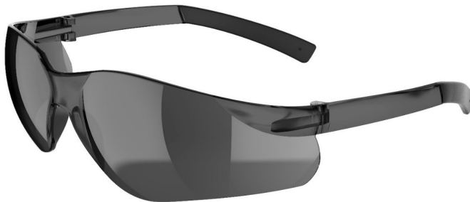
WeldOps SE-200 clear, grey